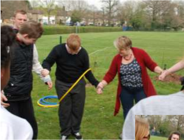
Team Building and Problem Solving