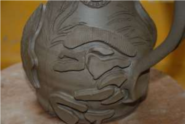
Ceramic jug in the style of Grayson Perry