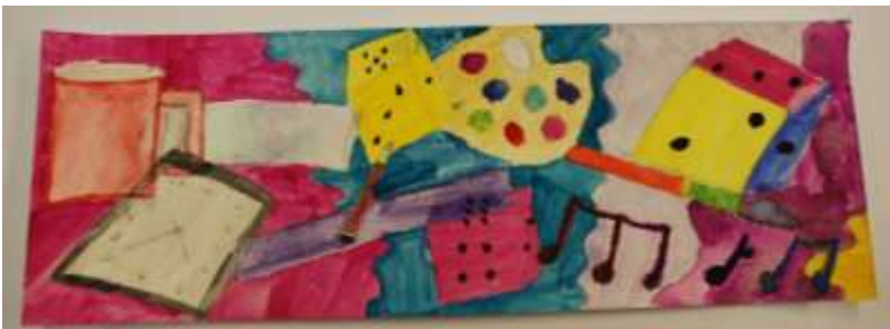
Mo'Nique Year 8